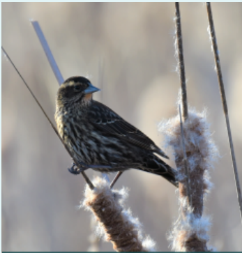
Female red-winged blackbird perched on seeding cattail

Numerous Economic, Cultural, and Environmental Values