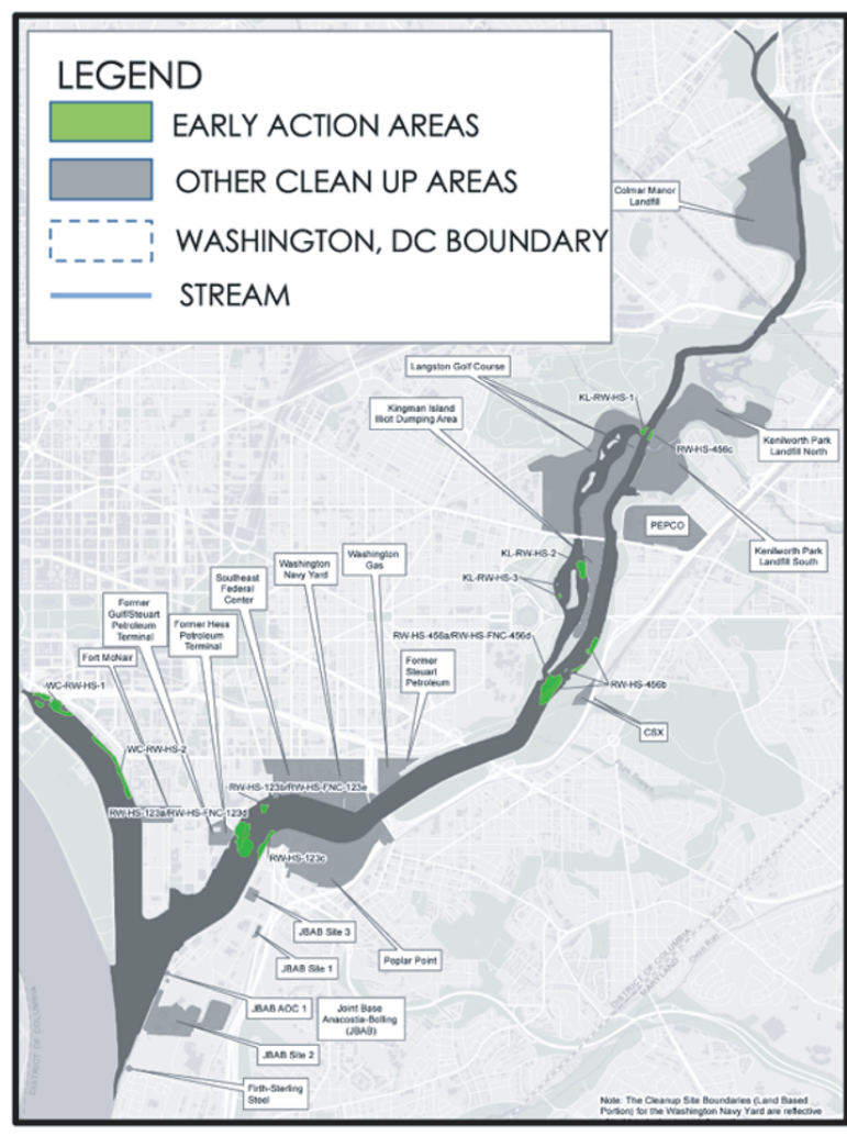
The figure above shows the study area and the 11 EAAs that are the subject of this Interim ROD.