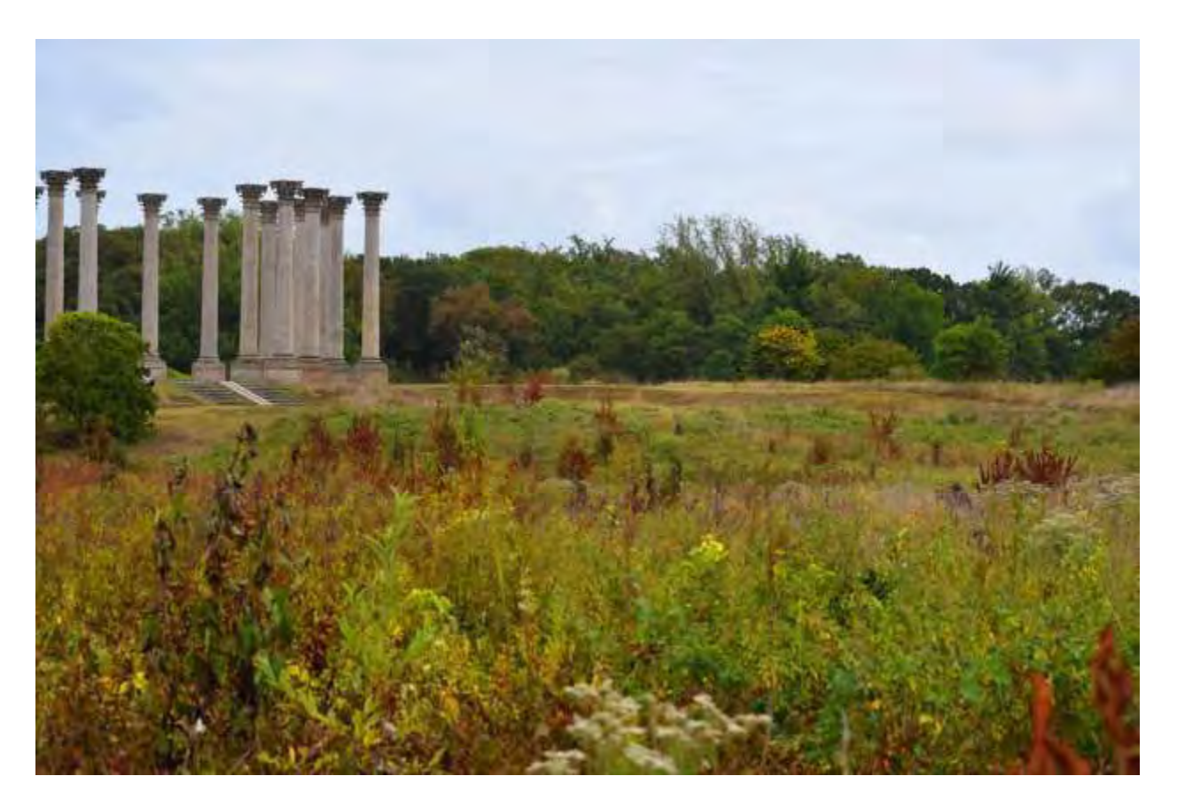
Enhancing Bee Habitat and Forage

Bee habitat and forage are deeply affected by land-use policies and practices such as development and monoculture agriculture. Here in the District we have the benefit of not being in an agriculture environment that is dominated by monocultures but we are faced with increased development of our open spaces. Luckily, we have the ability to choose what we plant and where we plant it. Even the smallest patch of land can make a difference for pollinators. Lush green lawns may look inviting but not if you are a pollinator. Pollinators rely on a variety of flowering plants for forage and bare ground for nesting. There are a variety of things that everyone can do that require minimal effort to enhance bee habitat and forage.