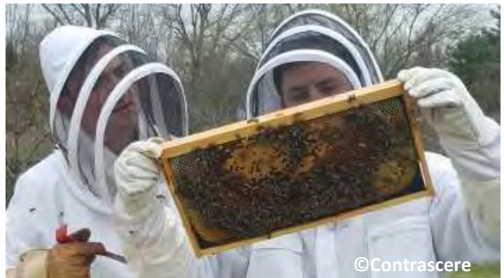
Beekeeping Best Management Practices

Beekeeping is legal in the District and regulated by DOEE. Managed bees depend on beekeepers to keep them safe and healthy. Honey bee declines have been reported across the country, including in the District. There are many factors that are associated with honey bee declines including pests such as parasitic varroa mites, poor nutrition as a result of habitat loss and degradation, viruses, and exposure to harmful pesticides.