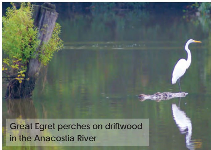
Great Egret perches on driftwood in the Anacostia River

DDOE is hard at work to restore full use of the Anacostia and Potomac Rivers and Rock Creek to District residents, visitors, and businesses. The SRC trading and RiverSmart Rewards programs are important parts of that effort.