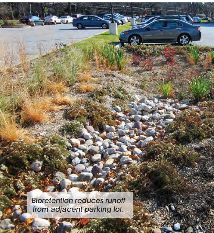
Bioretention reduces runoff from adjacent parking lot.

DDOE is hard at work to restore full use of the Anacostia and Potomac Rivers and Rock Creek to District residents, visitors, and businesses. The SRC trading and RiverSmart Rewards programs are important parts of that effort.